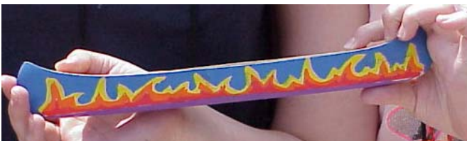
A River of Dreams canoe painted by a participant.

For more information on the River of Dreams Canoe Launch Program visit: www.internationalwaterinstitute.org or call 701-231-5266